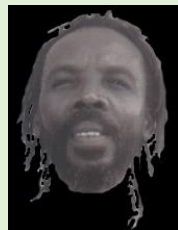
ELDER JAH ROOTSMAN

UNFOLDED AND DISCLOSED FROM THE MIND OF THE PATRIARCH